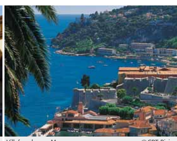
Villefranche sur Mer