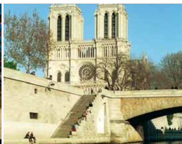
Notre Dame, Paris