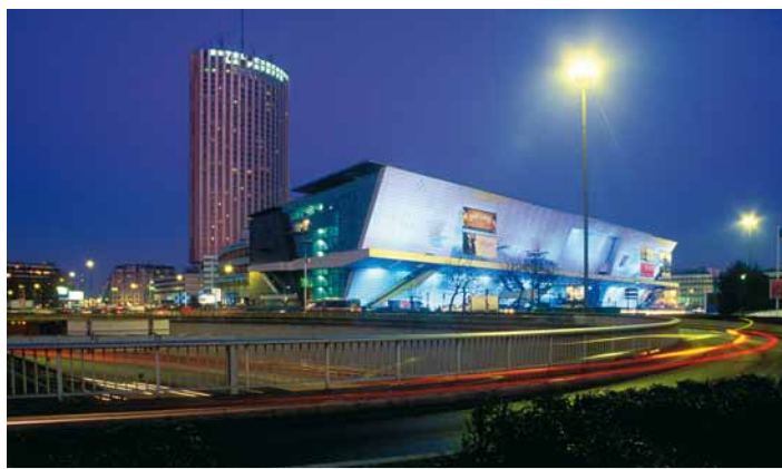
Palais des Congrès de Paris

metropolis of 1 million inhabitants, attracts more than 9 million visitors per year. Thanks to the Nice Côte d'Azur international airport, France's busiest airport after Paris, the French Riviera can be reached directly from 97 destinations, even the United States, and is conveniently served by more than 57 airlines. Altogether the Riviera offers a total of 8 convention and exhibition centres, among which are Monaco, Nice and Cannes, whose centres all have auditoriums with a maximum seating capacity of 6,500 people. The Acropolis Convention and Exhibition Centre in Nice, is classed as the top convention and exhibition centre in France after Paris and is ranked amongst the top ten in the world. The Grimaldi Forum in Monaco, futuristically-designed with glass walls and metal tubes, is a state-of-the-art convention centre for the 3rd millennium. The Palais des Festivals in Cannes, with its easy access, its 28 conference rooms (including an auditorium of 2,300 seats and the largest exhibition area under one roof) and its professional expertise was designed to welcome important international events such as the International Film Festival. The French Riviera Convention Bureau is launching a brand new initiative for the benefit of meetings and incentive organizers, "the meeting club", which brings together the best professionals on the French Riviera. ( www.frenchriviera-cb.com )