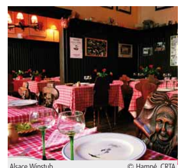
Alsace Winstub

Visits can be arranged to wine farms to enjoy wine-tasting combined with typical Alsatian culinary specialities and demonstrations