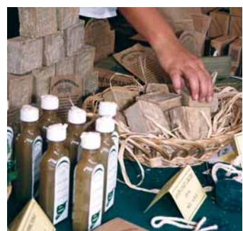
Scented produce of Grasse

The town of Grasse has always been the perfume capital. Visit the international museum of Grasse and look back over 4,000 years of perfume making, discovering the techniques used from ancient Egypt to today. Some perfumeries