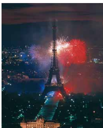
Tour Eiffel, Paris

A cruise along the Seine is an essential part of any visit to Paris and definitely not to be missed! As you glide along the water, you find yourself face to face with Paris's splendid museums and monuments. One-hour cruises are usually held in French and