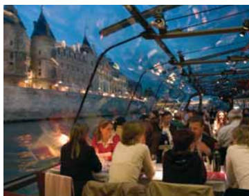
Dinner cruise, Bateau Parisien ©Amélie Dupont, PTO