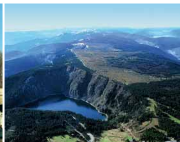
Alsace, Vosges