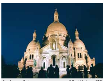
Sacré coeur, Paris