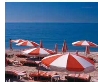
"Head for the Med"

Aquatic sports, mountain climbing, art and gourmet food - there are so many different ways to get away from it all on the French Riviera. Try your hand at cooking à la provençale - with its combination of vegetables, olive oil, herbs and spices. Provençale cuisine offers a tasty combination of fresh pro-