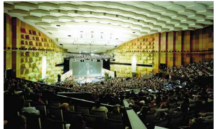
Strasbourg Convention and Conference Centre, Erasmus Auditorium

This report looks at the French capital and two border regions: Alsace and the French Riviera, presenting their wide-ranging and contrasting meeting facilities and incentive programmes.