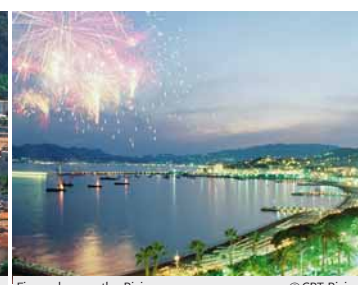
Fireworks over the Riviera