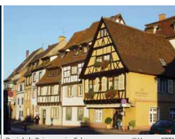
Quai de la Poissonnerie, Colmar