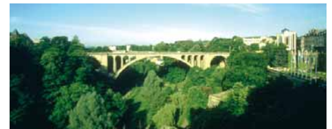
Neibréck (Pont Adolphe), Luxembourg City

P.O. Box 181 2011 Luxembourg T: +352 22 7565 F: +352 46 7073 E-mail: convention.bureau@lcto.lu Internet: www.lcb.lu