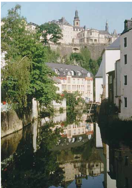
Luxembourg Old Town

Luxembourg offers a wide range of incentives from Moselle boat trips to castle visits in the Ardennes, from hot air ballooning to kayaking. However, its fine cuisine is particularly worth mentioning: Ardennes smoked ham, pork in aspic and Riesling pâtés, fish from the Moselle, chocolate pralines and excellent Moselle wines are proof of Luxembourg’s penchant for culinary delicacies.