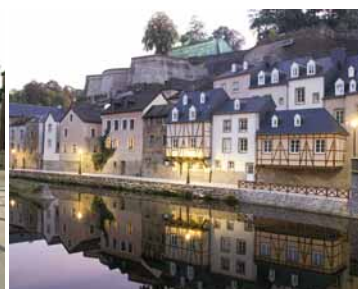
Grund District Luxembourg