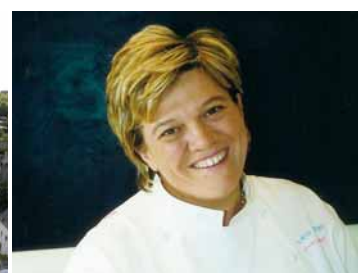
Léa Linster – star cook