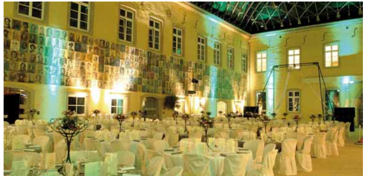
Centre Culturel de Rencontre Neumünster Abbey, Agora

and a warm, friendly service. Accor opened one new hotel during 2007 - the Novotel Luxembourg Centre - and the Sofitel Le Grand Ducal with a panoramic restaurant at the beginning of 2008. The Centre