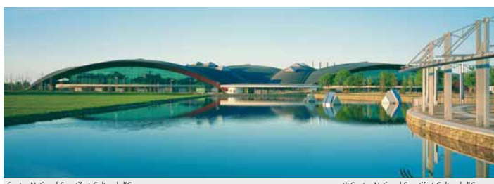
Centre National Sportif et Culturel d'Coque

An attractive pedestrian zone, parks and gardens invite relaxation, providing the ideal setting for refreshment and revitalisation, and ensuring the success of your event. From the vineyards on the Moselle to sites marking the Grand Duchy's iron- and steel-making past to the thermal spa, the range of touring programmes and individual sites for enjoyment is infinitely varied.