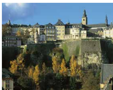
Corniche, Old Town