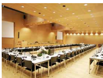
Chamber of Commerce Conference Centre