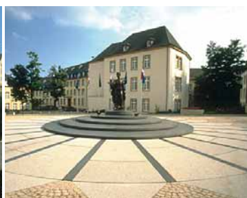
Memorial statue to the Grande Duchesse Charlotte