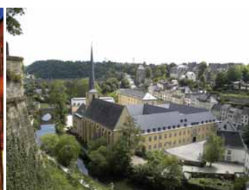
View of Neumünster Abbey