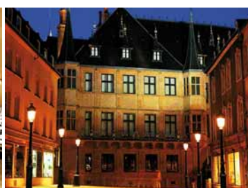
Palais Grand Ducal