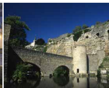
Casemates and River Alzette