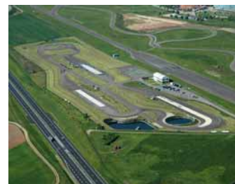
Driving Safety Centre

After an incentive you should come home richer for the experience, which in this case is one that might even save your life one day. The Driving Safety Centre offers you the chance to really refine your driving technique. This purpose-built driver training facility provides a safe, controlled environment