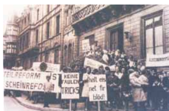
Women campaigning for the right to vote

Enjoy the sights and culinary specialities of Luxembourg at the same time! Throughout this culinary city sightseeing tour in the heart of Luxembourg City, we invite you to discover the picturesque quarters and prodigious panoramas of a millennial fortress city whilst savouring here and there delicious specialities and native products.