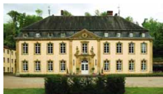
Château de Septfontaines ©Villeroy & Boch

The smallest member of the European Union, Luxembourg was nevertheless the cradle where the concept of a unified Europe was born. Together with Brussels and Strasbourg, Luxembourg city is the official seat of many of the European Union's major institutions. A multicultural city by tradition, Luxembourg continues to enhance its cosmopolitan nature. Modern architecture marks the silhouette of the banking district that has made Luxembourg famous throughout the world of high finance. The historic fortified city has in modern times become a world-class bastion of finance. Attracted by its numerous advantages, financial institutions from around the world manage their business from Luxembourg.