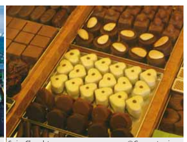
Swiss Chocolates