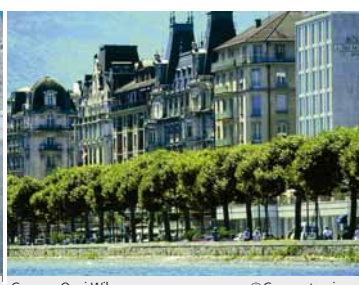
Geneva, Quai Wilson