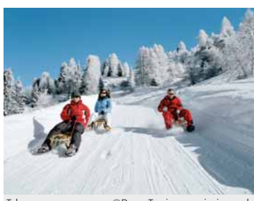
Toboggan run

breathtaking views of the mountains in six countries. The tour continues with a trip to the picturesque town of Appenzell. The pedestrian zone with its beautifully decorated house façades invites you to take a leisurely stroll and to enjoy the shops. A visit to the Appenzell Museum provides interesting information on the region’s traditions and way of life. See www.zuerich.com For other destinations, see www.MySwitzerland.com/Mice .