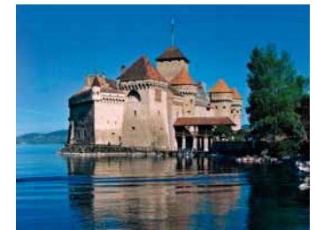
Chateaux de Chillon

The first stop is a chocolate factory where the art of making fine Swiss chocolate is demonstrated. Afterwards, visitors are taken to Schwägälp (1,352m) and then by cable car to Säntis (2,502m), the highest mountain in Eastern Switzerland with