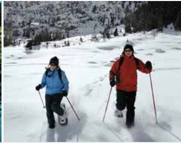
Snowshoe trekking