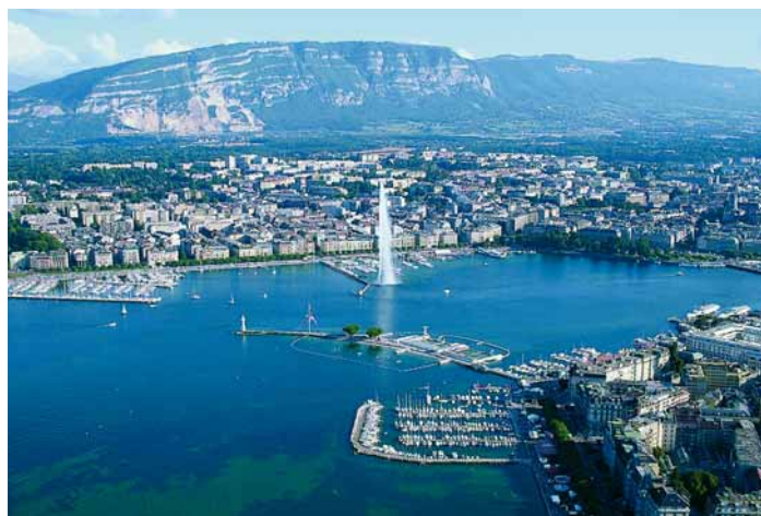
Aerial view of Geneva

World leaders meet here at the Annual World Economic Forum. The town's infrastructure is ideal for conventions, seminars and incentives. The convention centre is an architectural feat, backed by a superb range of hotels specializing in seminar hosting. Conferencing groups are wooed with curling tournaments, snow Olympics, mountain bike tours and sailing classes, neatly scheduled between and after meetings. Perhaps part of Davos' appeal as a meeting centre is simply the fresh mountain air, which relaxes guests and focuses them on their meeting or training course.