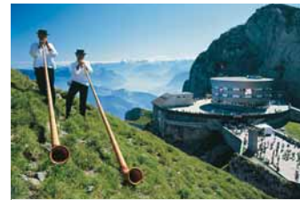
Mt. Pilatus

hunts, cultural rallies with chocolate or cheese making as a theme to picturesque lake cruises. Virtually any sport is available in Geneva. The lake is ideal for all kinds of water sports. The rivers which flow through