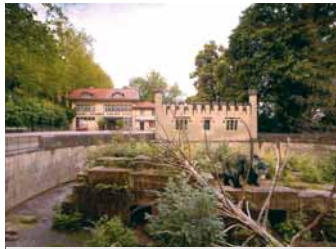
The Bear Pits, Bern

Groups can go on a Rhine River Cruise and admire medieval Basel, the historic city walls and its harbour during a 2-hour boat trip. Another programme entitled “Modern Art & Architecture” is a theme-based city tour. Discover some of the town’s hallmark buildings designed by world-famous architects such as Mario Botta, Renzo Piano, Frank Gehry or Herzog & DeMeuron and admire countless works by internationally renowned artists such as Jean Tinguely or Richard Serra, which add to the character of Basel. For more information, see www.baseltourismus.ch .