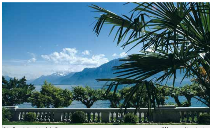
Palm Trees & Mountains, Lake Geneva

Montreux is barely an hour's drive away from the intercontinental