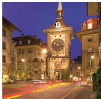
Bern, Zytglogge

Bern, the capital of Switzerland, lies at the heart of the country and is easily accessible by road, rail and air. Over 100 conferences, meetings and seminars take place here every year. The city offers an excellent infrastructure for conventions. The fairgrounds of the BEA bernexpo provide over 35,500m 2 of hall space and 100,000m 2 of grounds. Its convention centre has a capacity of 600.