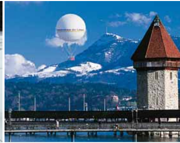
Lucerne, Chapel Bridge and HIFLYER