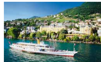
Steamboat, Lake Geneva

town. Chic hotels, lake promenade, Chapel Bridge with its superb gable paintings of old war scenes, the lovely old alleyways, the two mountain giants Pilatus and Rigi, the captivating panorama of snow-covered mountains at its doorstep – Lucerne does indeed look like a picture postcard. Lucerne lies on Europe's most important north-south route and is also linked to the Swiss federal rail network in six directions. Direct trains link Lucerne with the international airports of Geneva and Zurich, the latter airport being only one hour away. Like Bayreuth and Salzburg, Lucerne is one of the