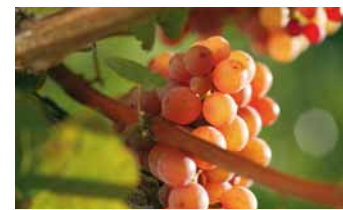
Gewürztraminer grapes

Blessed by beautiful scenery, at the shores of Lake Geneva, between vineyards and the Alps (highest peak, the Mont-Blanc 4,848m), Geneva is the starting point for various exciting excursions. The various incentive activities range from treasure