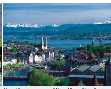
View of Zurich